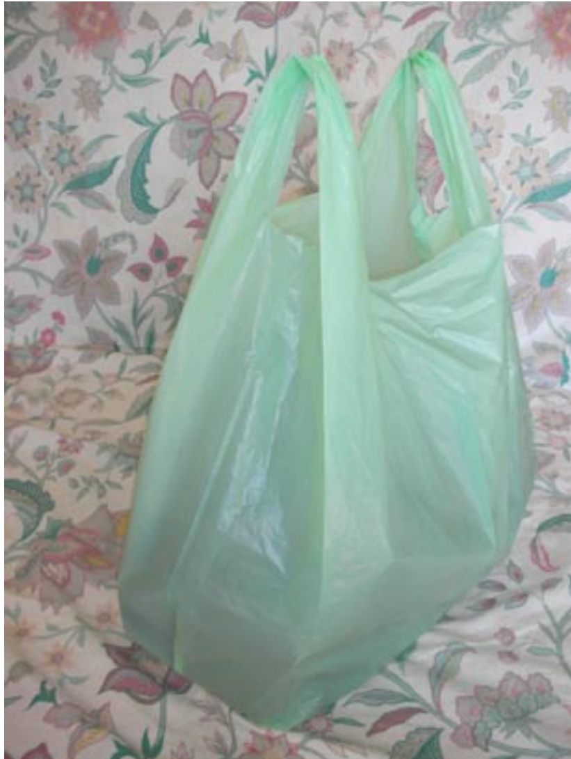
The Dream City Bag *R.I.P bag* design Sibylle Stöckli, Lausanne, 30 – 03 – 2009 for MondayJazz by louise blanche